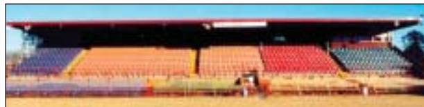
The Duncan Thompson stand before refurbishment.