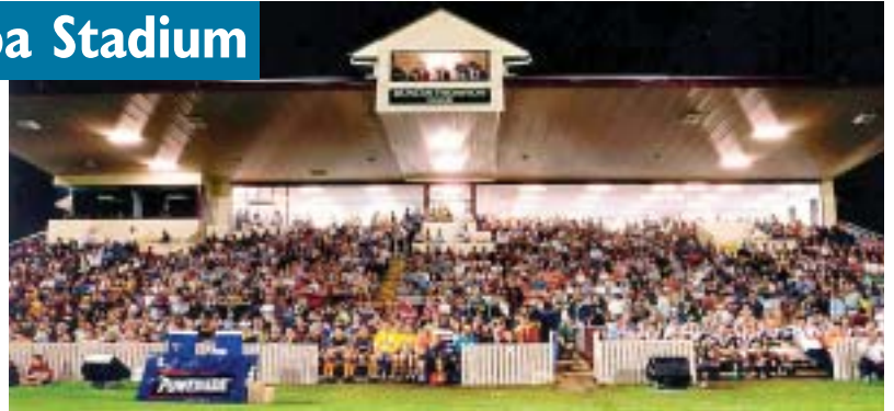
Opening night at Stadium Toowoomba drew a large crowd.

request of the client, was compressed to allow the once a year pre-season rugby league match, featuring the Brisbane Broncos, to take place.