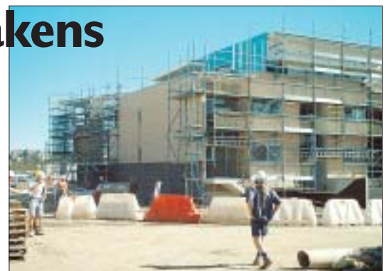
River Edge at Bulimba ... first 2 stages sold out.