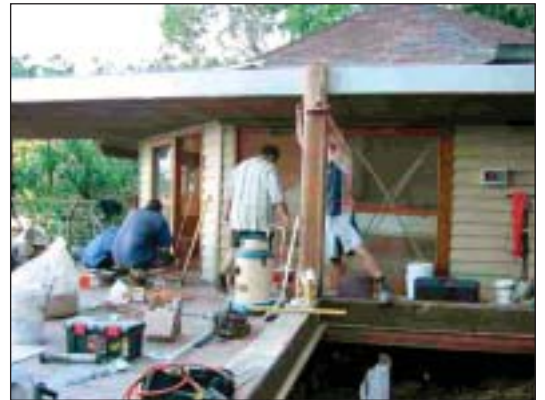
Bedarra resort villa upgrade.

Lizard Island – New gymnasium, upgrading of premium villa and alterations