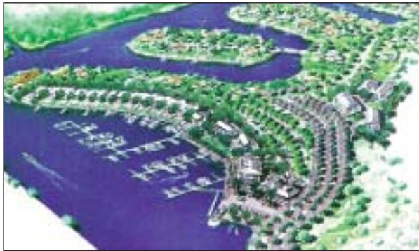
The future – An artist's impression of the Bluewater canal aerial view and marina perspective (below).