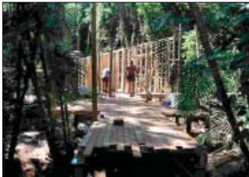
Dunk Island spa walkway.