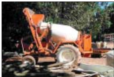
Concrete mixer ... island style.

HUTCHIES' crew members have taken off to four top resorts in North Queensland, but work – not play – is on their minds.