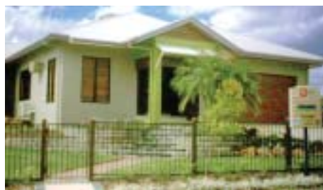
The display home ... sold in one week.

While driver and passenger escaped unharmed but shaken, Michael's new prized Ford ute, however, did not fare as well, ending up in a ditch and connecting with a concrete pipe near railway lines.