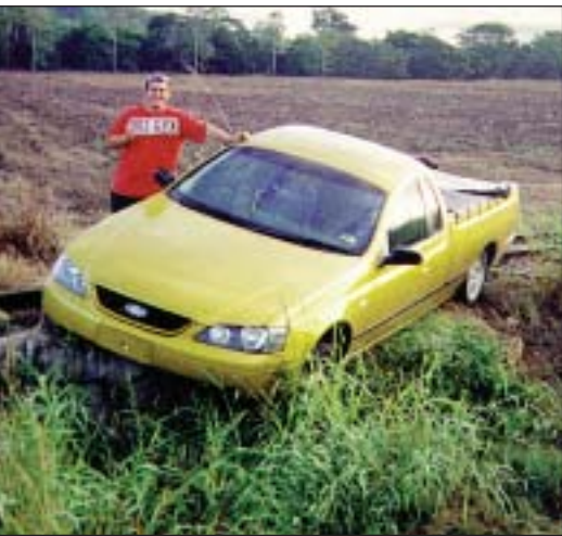
... with a "smile for life", lucky to be alive.